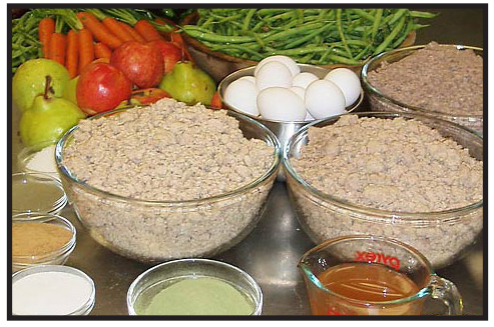
Ingredients for Homemade Dog Food

Whether to feed a manufactured dog diet or feed raw, homemade or the BARF diet (which stands for Bones And Raw Food) is a highly controversial subject in the dog world today. I know people who swear by one or the other.