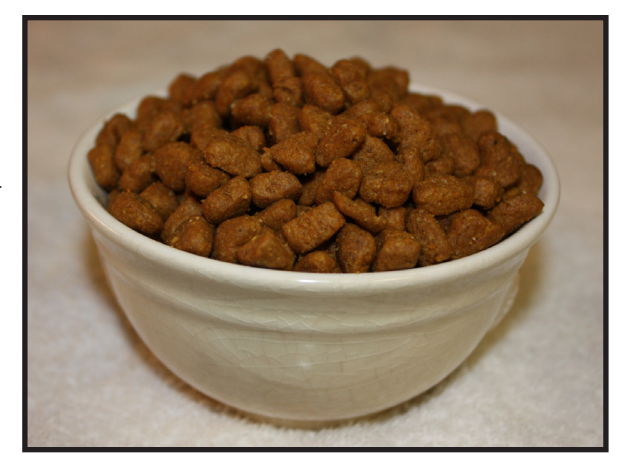
Dry Dog Food

Throwing a raw steak down on the floor for your dog to eat is not going to be sufficient to met your dogs dietary needs. Wild dogs of all types (wolves, foxes, coyotes etc) eat a diet of meat and vegetation, thus are classified as omnivores, vs true carnivores, which only eat meat. When watching a wolf eat a deer or elk (herbivores),