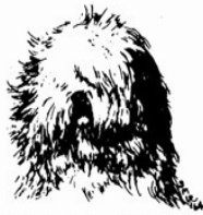
Old English Sheepdog Club of America Inc.

September 26, 2016 - Event # 2016200807 Limited to Old English Sheepdogs