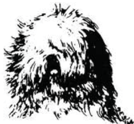
Old English Sheepdog Club of America Inc.