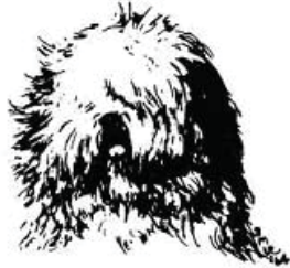
Old English Sheepdog Club of America Inc.