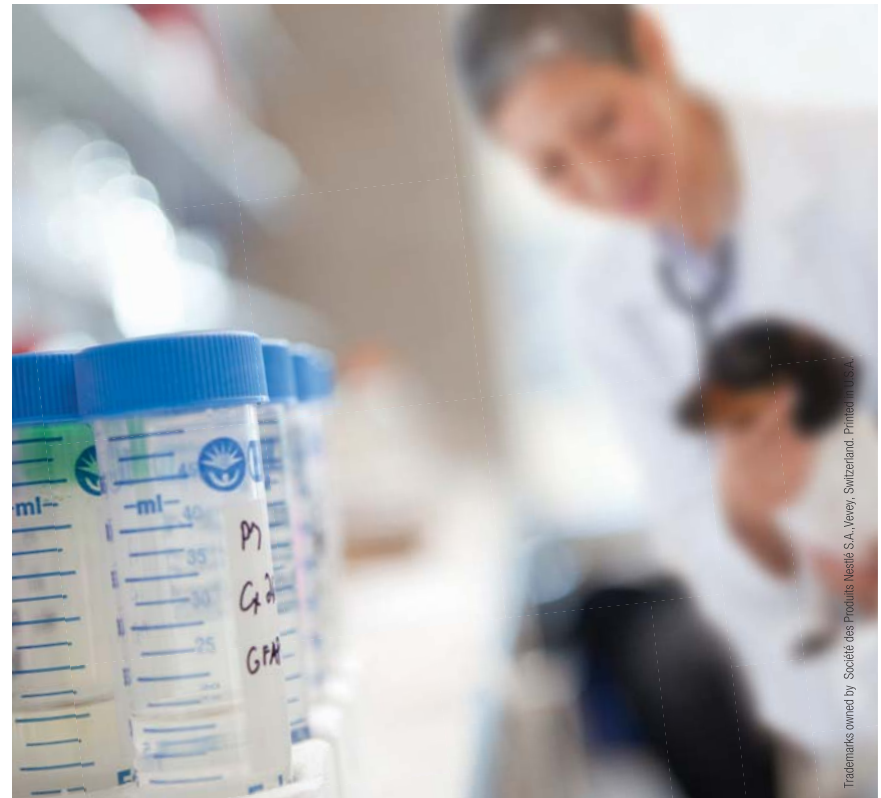
Trademarks owned by Société des Produits Nestlé S.A., Vevey, Switzerland. Printed in U.S.A.

For Trial Secretary Use Only: APPROVED: _____ DATE: _____